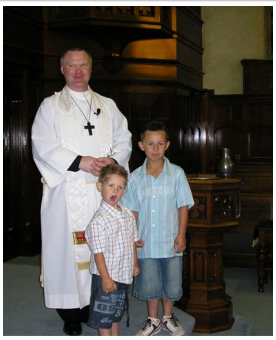
INTO WHAT WERE YOU BAPTISED?