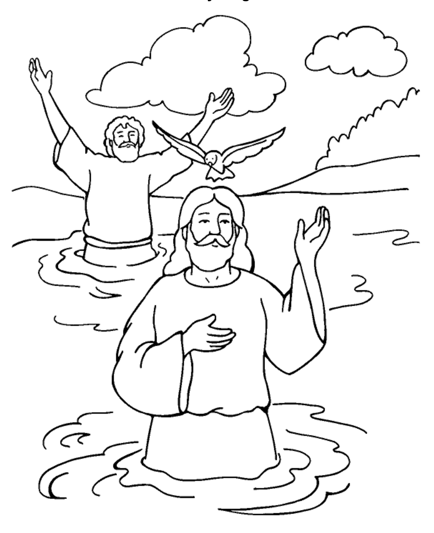
For the young ones